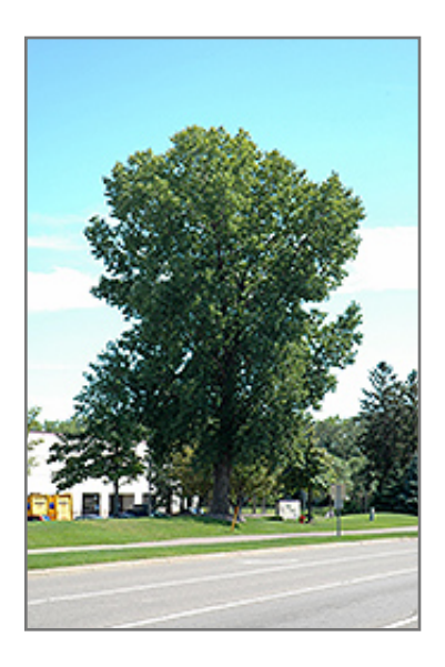
Siouxland Poplar