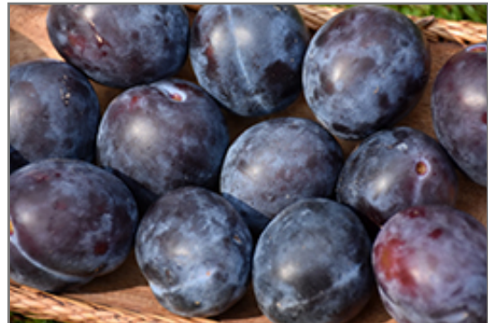
Mount Royal Plum fruit