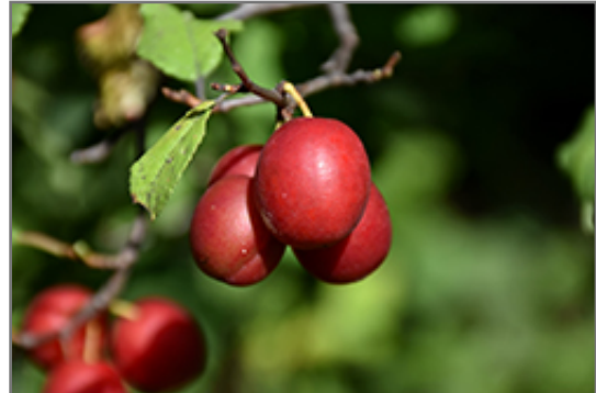
Toka Plum fruit