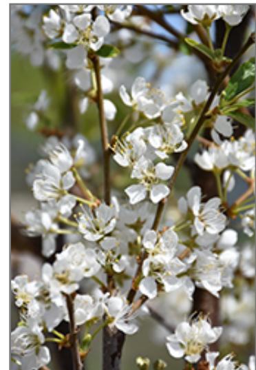
Toka Plum flowers