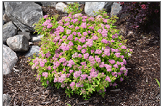
Dakota Goldcharm Spirea in bloom