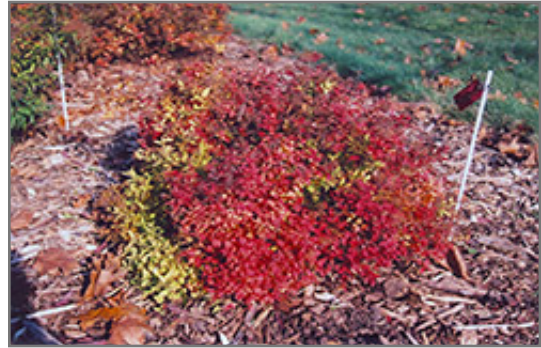
Dakota Goldcharm Spirea in fall

This shrub should only be grown in full sunlight. It prefers to grow in average to moist conditions, and shouldn't be allowed to dry out. It is not particular as to soil type or pH. It is highly tolerant of urban pollution and will even thrive in inner city environments. This is a selected variety of a species not originally from North America.