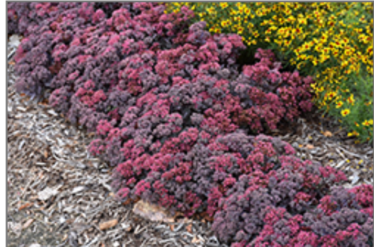
Dazzleberry Stonecrop in bloom