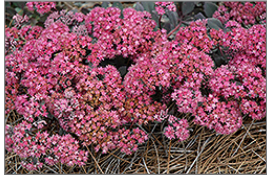
Dazzleberry Stonecrop flowers

Dazzleberry Stonecrop is a dense herbaceous perennial with an upright spreading habit of growth. Its medium texture blends into the garden, but can always be balanced by a couple of finer or coarser plants for an effective composition.