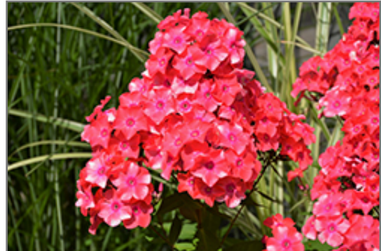
Flame Coral Garden Phlox flowers

Flame Coral Garden Phlox is a dense herbaceous perennial with an upright spreading habit of growth. Its medium texture blends into the garden, but can always be balanced by a couple of finer or coarser plants for an effective composition.