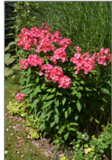
Flame Coral Garden Phlox in bloom