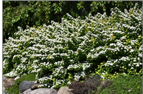
Glow Girl Birch Leaf Spirea in bloom

Glow Girl Birch Leaf Spirea is recommended for the following landscape applications;