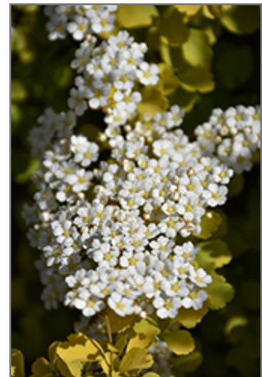
Glow Girl Birch Leaf Spirea flowers