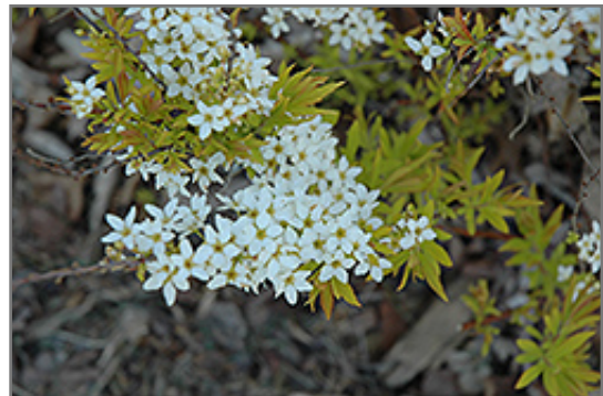
Mellow Yellow Spirea flowers