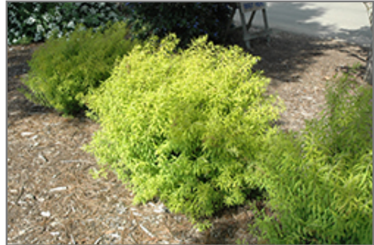
Mellow Yellow Spirea

This is a high maintenance shrub that will require regular care and upkeep, and should only be pruned after flowering to avoid removing any of the current season's flowers. It is a good choice for attracting butterflies to your yard, but is not particularly attractive to deer who tend to leave it alone in favor of tastier treats. It has no significant negative characteristics.