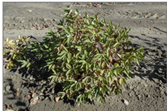
Little Rebel Dogwood