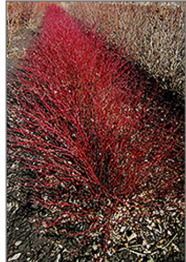
Little Rebel Dogwood in winter

This shrub does best in full sun to partial shade. It is an amazingly adaptable plant, tolerating both dry conditions and even some standing water. It is not particular as to soil type or pH. It is highly tolerant of urban pollution and will even thrive in inner city environments. This is a selected variety of a species not originally from North America.