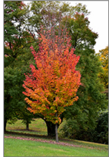
Red Rocket Red Maple in fall

This is a relatively low maintenance tree, and should only be pruned in summer after the leaves have fully developed, as it may 'bleed' sap if pruned in late winter or early spring. It has no significant negative characteristics.