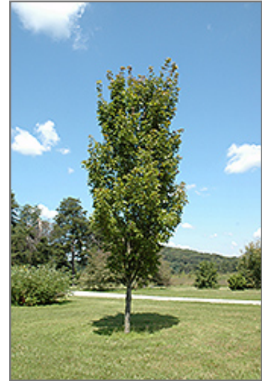
Red Rocket Red Maple

This tree should only be grown in full sunlight. It is quite adaptable, preferring to grow in average to wet conditions, and will even tolerate some standing water. It is not particular as to soil type, but has a definite preference for acidic soils, and is subject to chlorosis (yellowing) of the foliage in alkaline soils. It is somewhat tolerant of urban pollution. This is a selection of a native North American species.