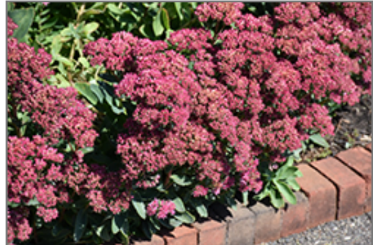
Carl Stonecrop in bloom

Carl Stonecrop is a dense herbaceous perennial with an upright spreading habit of growth. Its medium texture blends into the garden, but can always be balanced by a couple of finer or coarser plants for an effective composition.