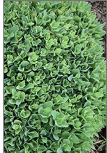
Carl Stonecrop foliage

Carl Stonecrop is a fine choice for the garden, but it is also a good selection for planting in outdoor pots and containers. It is often used as a 'filler' in the 'spiller-thriller-filler' container combination, providing a mass of flowers and foliage against which the larger thriller plants stand out. Note that when growing plants in outdoor containers and baskets, they may require more frequent waterings than they would in the yard or garden. Be aware that in our climate, most plants cannot be expected to survive the winter if left in containers outdoors, and this plant is no exception. Contact our experts for more information on how to protect it over the winter months.