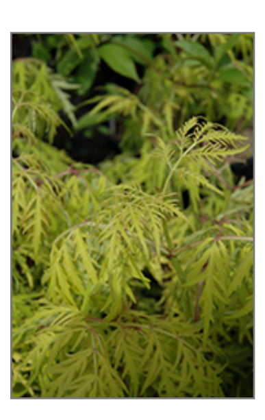
Lemony Lace Elder foliage

Lemony Lace Elder features showy clusters of lightly-scented creamy white flowers held atop the branches in mid spring. It has attractive gold deciduous foliage which emerges antique red in spring. The deeply cut ferny compound leaves are highly ornamental but do not develop any appreciable fall color. The red fruits are held in abundance in spectacular clusters in early fall.