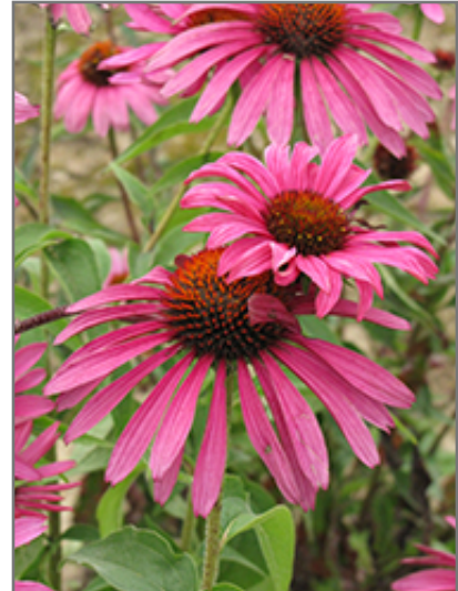
Ruby Star Coneflower flowers

Ruby Star Coneflower is recommended for the following landscape applications;