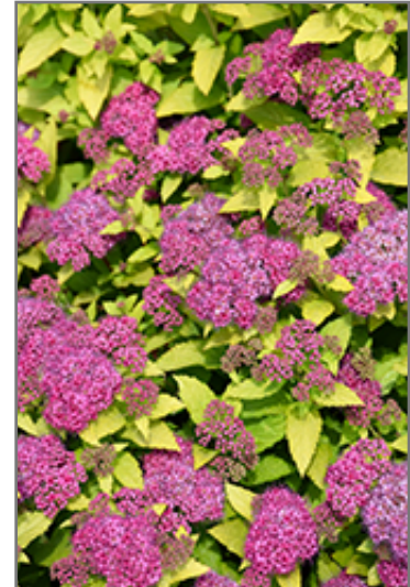
Double Play Gold Spirea flowers

Double Play Gold Spirea is a multi-stemmed deciduous shrub with a more or less rounded form. Its relatively fine texture sets it apart from other landscape plants with less refined foliage.