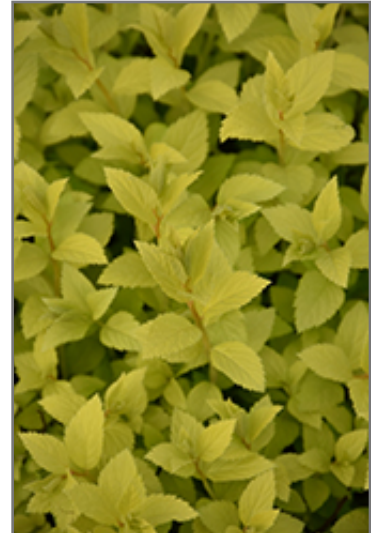
Double Play Gold Spirea foliage

This shrub should only be grown in full sunlight. It prefers to grow in average to moist conditions, and shouldn't be allowed to dry out. It is not particular as to soil type or pH. It is highly tolerant of urban pollution and will even thrive in inner city environments. This is a selected variety of a species not originally from North America.