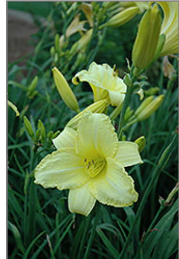
Happy Ever Appster Happy Returns Daylily flowers

Happy Ever Appster Happy Returns Daylily is recommended for the following landscape applications;