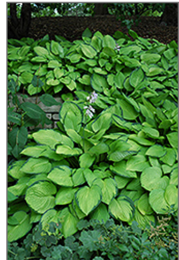
Gold Standard Hosta in bloom