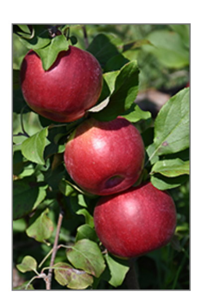
Hazen Apple fruit

This is a deciduous tree with a more or less rounded form. Its average texture blends into the landscape, but can be balanced by one or two finer or coarser trees or shrubs for an effective composition. This is a high maintenance plant that will require regular care and upkeep, and is best pruned in late winter once the threat of extreme cold has passed. Gardeners should be aware of the following characteristic(s) that may warrant special consideration;