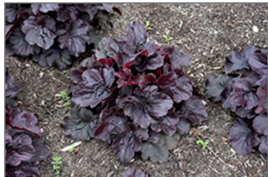
Northern Exposure Black Coral Bells