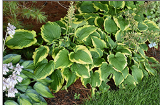
Spartacus Hosta