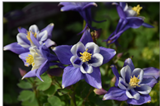
Earlybird Blue and White Columbine flowers