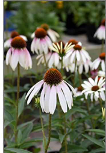
Pretty Parasols Coneflower flowers

Pretty Parasols Coneflower is recommended for the following landscape applications;