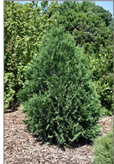
Technito Arborvitae