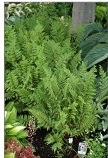
Lady in Red Fern