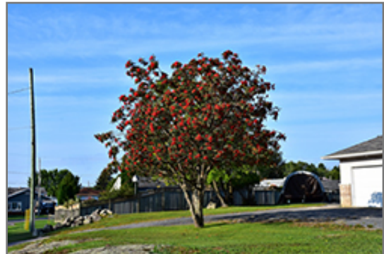
Showy Mountain Ash fruit

Showy Mountain Ash is recommended for the following landscape applications;