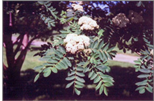
Showy Mountain Ash flowers

This tree should only be grown in full sunlight. It is very adaptable to both dry and moist locations, and should do just fine under average home landscape conditions. It is not particular as to soil type or pH. It is highly tolerant of urban pollution and will even thrive in inner city environments. This species is native to parts of North America.