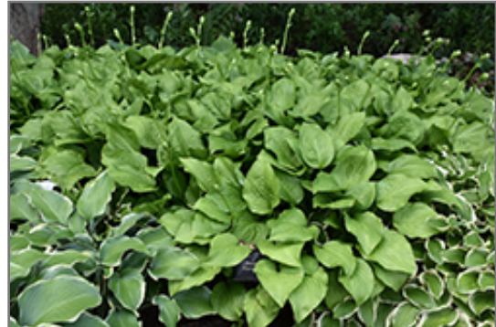
Royal Standard Hosta