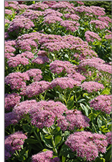
Brilliant Stonecrop flowers

Brilliant Stonecrop is recommended for the following landscape applications;