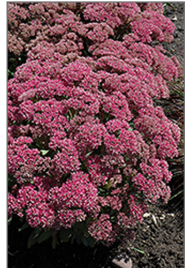
Mr. Goodbud Stonecrop flowers

Mr. Goodbud Stonecrop is recommended for the following landscape applications;