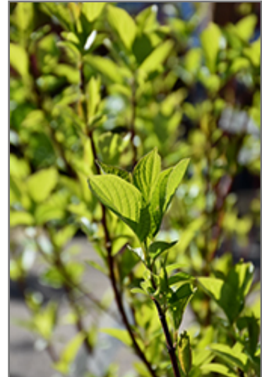
Bailey Red-Twig Dogwood foliage

This shrub does best in full sun to partial shade. It is an amazingly adaptable plant, tolerating both dry conditions and even some standing water. It is not particular as to soil type or pH. It is highly tolerant of urban pollution and will even thrive in inner city environments. This species is native to parts of North America.