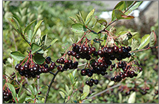
Autumn Magic Black Chokeberry fruit

This shrub should only be grown in full sunlight. It is an amazingly adaptable plant, tolerating both dry conditions and even some standing water. It is not particular as to soil type or pH, and is able to handle environmental salt. It is somewhat tolerant of urban pollution. This is a selection of a native North American species.