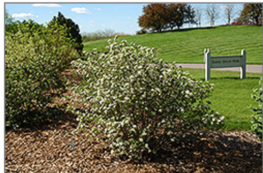
Autumn Magic Black Chokeberry in bloom