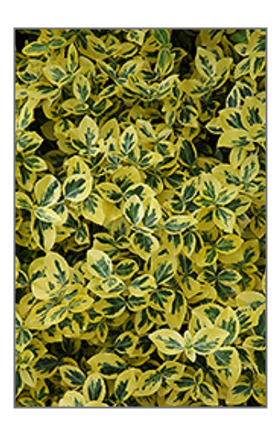
Emerald 'n' Gold Wintercreeper foliage

Emerald 'n' Gold Wintercreeper is recommended for the following landscape applications;