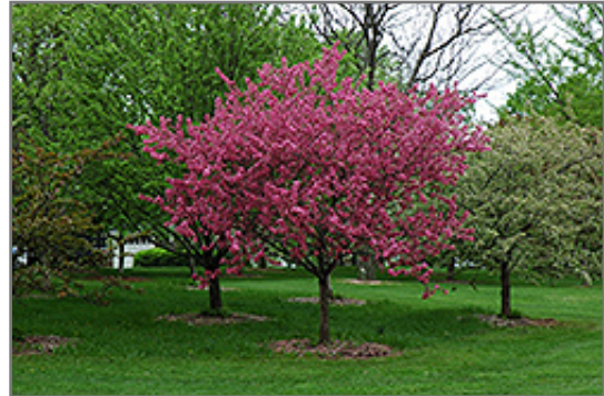
Prairifire Flowering Crab in bloom

This tree will require occasional maintenance and upkeep, and is best pruned in late winter once the threat of extreme cold has passed. It has no significant negative characteristics.