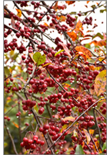
Prairifire Flowering Crab fruit

This tree should only be grown in full sunlight. It prefers to grow in average to moist conditions, and shouldn't be allowed to dry out. It is not particular as to soil type or pH. It is highly tolerant of urban pollution and will even thrive in inner city environments. This particular variety is an interspecific hybrid.