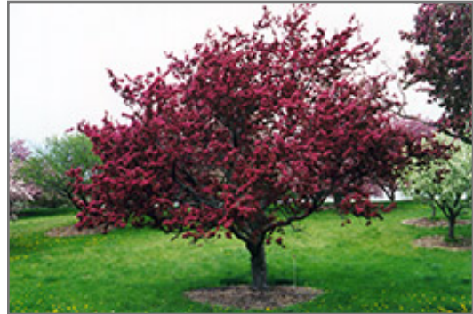
Profusion Flowering Crab in bloom