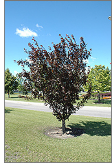
Thunderchild Flowering Crab

This tree should only be grown in full sunlight. It prefers to grow in average to moist conditions, and shouldn't be allowed to dry out. It is not particular as to soil type or pH. It is highly tolerant of urban pollution and will even thrive in inner city environments. This particular variety is an interspecific hybrid.