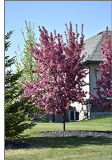
Thunderchild Flowering Crab in bloom

This tree will require occasional maintenance and upkeep, and is best pruned in late winter once the threat of extreme cold has passed. It has no significant negative characteristics.