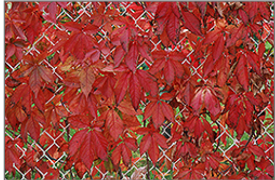
Englemann Ivy in fall