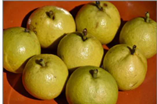
Golden Spice Pear fruit