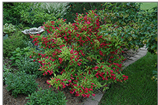
Red Prince Weigela in bloom