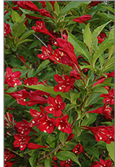
Red Prince Weigela flowers

Red Prince Weigela is recommended for the following landscape applications;