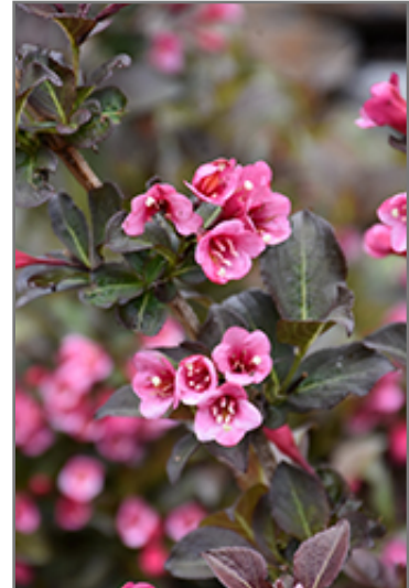
Tango Weigela flowers

Tango Weigela is recommended for the following landscape applications;