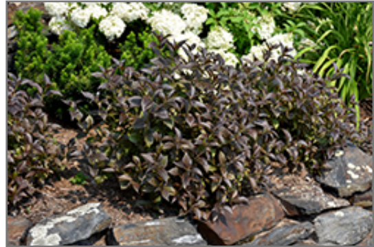
Tango Weigela

Tango Weigela makes a fine choice for the outdoor landscape, but it is also well-suited for use in outdoor pots and containers. With its upright habit of growth, it is best suited for use as a 'thriller' in the 'spiller-thriller-filler' container combination; plant it near the center of the pot, surrounded by smaller plants and those that spill over the edges. It is even sizeable enough that it can be grown alone in a suitable container. Note that when grown in a container, it may not perform exactly as indicated on the tag - this is to be expected. Also note that when growing plants in outdoor containers and baskets, they may require more frequent waterings than they would in the yard or garden. Be aware that in our climate, most plants cannot be expected to survive the winter if left in containers outdoors, and this plant is no exception. Contact our experts for more information on how to protect it over the winter months.