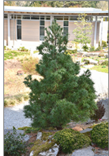
Mini Twists White Pine