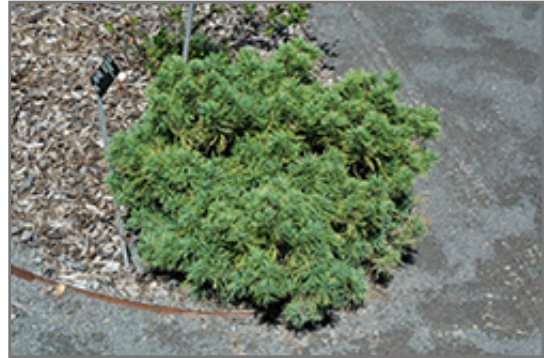
Mini Twists White Pine Photo courtesy of NetPS Plant Finder

Mini Twists White Pine will grow to be about 3 feet tall at maturity, with a spread of 4 feet. It tends to fill out right to the ground and therefore doesn't necessarily require facer plants in front. It grows at a slow rate, and under ideal conditions can be expected to live for 50 years or more.