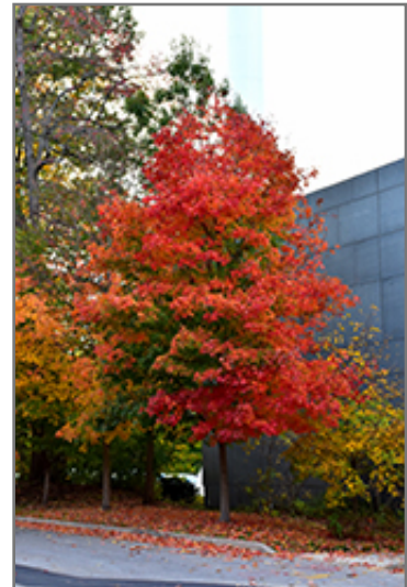
Fall Fiesta Sugar Maple in fall