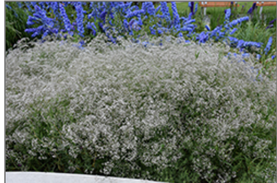
Common Baby's Breath in bloom