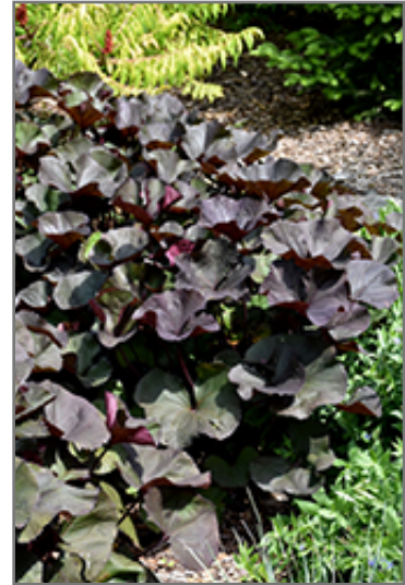
Britt Marie Crawford Rayflower foliage

This plant does best in partial shade to shade. It prefers to grow in moist to wet soil, and will even tolerate some standing water. It is not particular as to soil pH, but grows best in rich soils. It is somewhat tolerant of urban pollution. This is a selected variety of a species not originally from North America. It can be propagated by division; however, as a cultivated variety, be aware that it may be subject to certain restrictions or prohibitions on propagation.