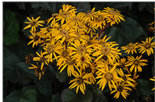
Britt Marie Crawford Rayflower flowers