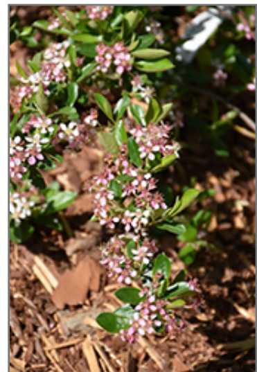
Ground Hug Aronia flowers