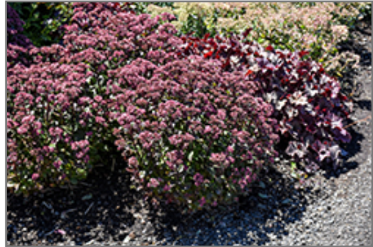
Double Martini Stonecrop in bloom