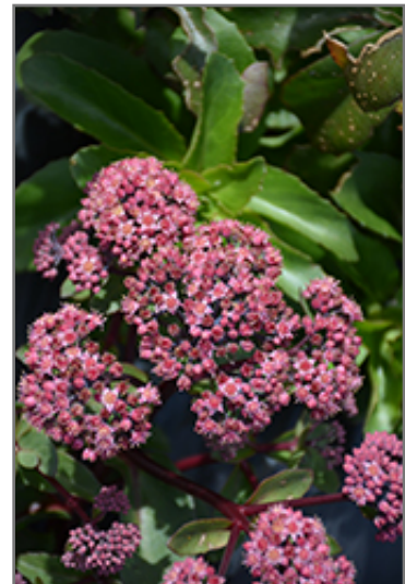
Double Martini Stonecrop flowers