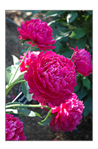
Paul Wild Peony flowers

Paul Wild Peony will grow to be about 30 inches tall at maturity, with a spread of 3 feet. When grown in masses or used as a bedding plant, individual plants should be spaced approximately 30 inches apart. The flower stalks can be weak and so it may require staking in exposed sites or excessively rich soils. It grows at a slow rate, and under ideal conditions can be expected to live for approximately 20 years. As an herbaceous perennial, this plant will usually die back to the crown each winter, and will regrow from the base each spring. Be careful not to disturb the crown in late winter when it may not be readily seen!