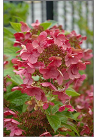
Quick Fire Hydrangea flowers (faded)

This shrub performs well in both full sun and full shade. It prefers to grow in average to moist conditions, and shouldn't be allowed to dry out. It is not particular as to soil type or pH. It is highly tolerant of urban pollution and will even thrive in inner city environments. Consider applying a thick mulch around the root zone in winter to protect it in exposed locations or colder microclimates. This is a selected variety of a species not originally from North America.