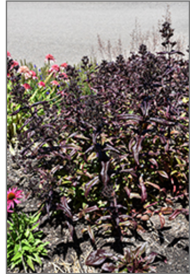
Dakota Burgundy Beard Tongue

Dakota Burgundy Beard Tongue is a fine choice for the garden, but it is also a good selection for planting in outdoor pots and containers. With its upright habit of growth, it is best suited for use as a 'thriller' in the 'spiller-thriller-filler' container combination; plant it near the center of the pot, surrounded by smaller plants and those that spill over the edges. Note that when growing plants in outdoor containers and baskets, they may require more frequent waterings than they would in the yard or garden. Be aware that in our climate, most plants cannot be expected to survive the winter if left in containers outdoors, and this plant is no exception. Contact our experts for more information on how to protect it over the winter months.