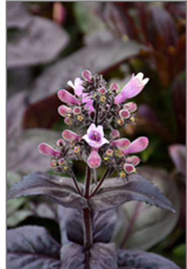
Dakota Burgundy Beard Tongue flowers

Dakota Burgundy Beard Tongue is an herbaceous perennial with an upright spreading habit of growth. Its medium texture blends into the garden, but can always be balanced by a couple of finer or coarser plants for an effective composition.