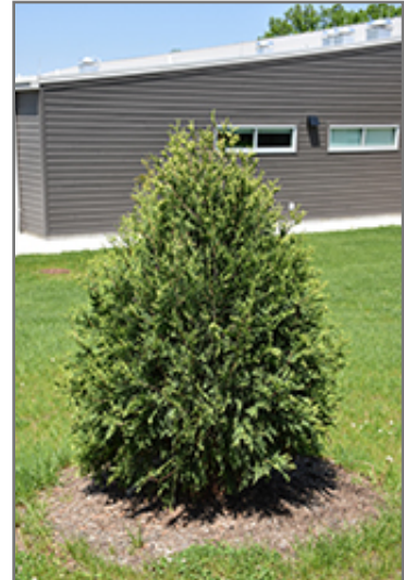
Technito Arborvitae