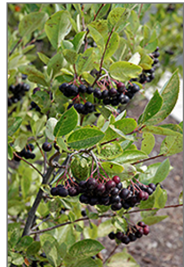
Iroquois Beauty Black Chokeberry fruit