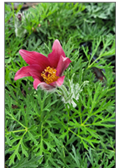
Red Pasqueflower flowers