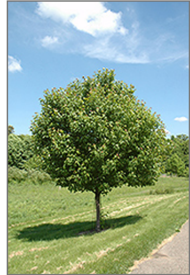
Northwood Red Maple

This tree should only be grown in full sunlight. It is quite adaptable, preferring to grow in average to wet conditions, and will even tolerate some standing water. It is not particular as to soil type, but has a definite preference for acidic soils, and is subject to chlorosis (yellowing) of the foliage in alkaline soils. It is somewhat tolerant of urban pollution. This is a selection of a native North American species.