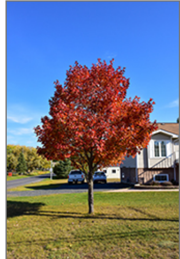
Northwood Red Maple in fall